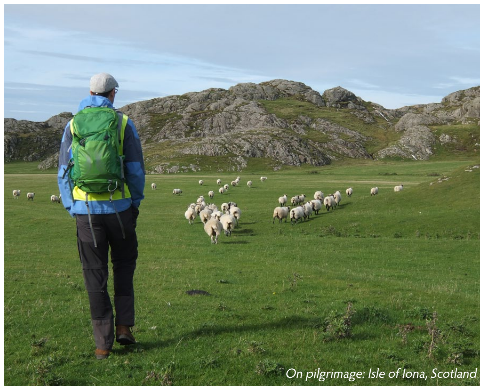
On pilgrimage: Isle of Iona, Scotland